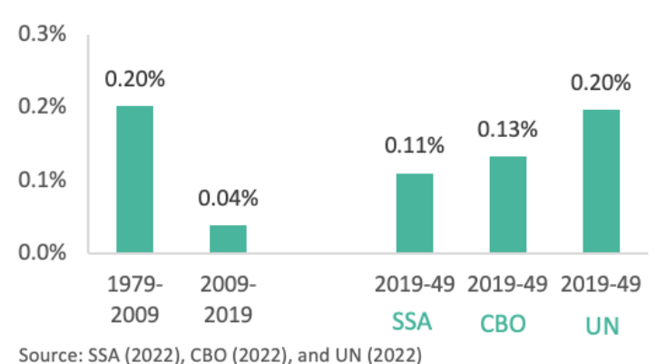
Figure 3 Average Annual Growth Rate in U.S. Life Expectancy, History and Projection Scenarios

Only time will tell whether this optimism is justified. In our view, however, it would be a mistake to take a turnaround for granted. The health of younger cohorts of Americans has been deteriorating, both relative to older cohorts of Americans and to younger cohorts in other developed countries. Putting life expectancy back on an upward trajectory may require a major, multi-year educational campaign, as well as massive new investments in health and health equity. Too much is at stake to leave it to chance.