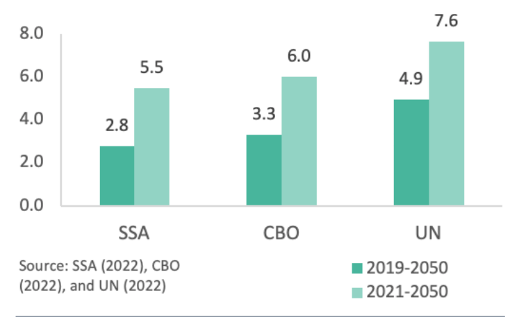
Figure 2 Projected Improvement in U.S. Life Expectancy, by Period and Scenario

In setting projection assumptions, it is necessary to make judgement calls about whether departures from long-term trends are merely temporary deviations or represent new long-term trends. The SSA, CBO, and UN apparently believe that the recent slowdown in U.S. life expectancy is a temporary deviation, and so assume that the rate of improvement in life expectancy will again accelerate to something closer to (or in the case of the UN, equal to) its longer-term pre-2010s trend. (See figure 3.)