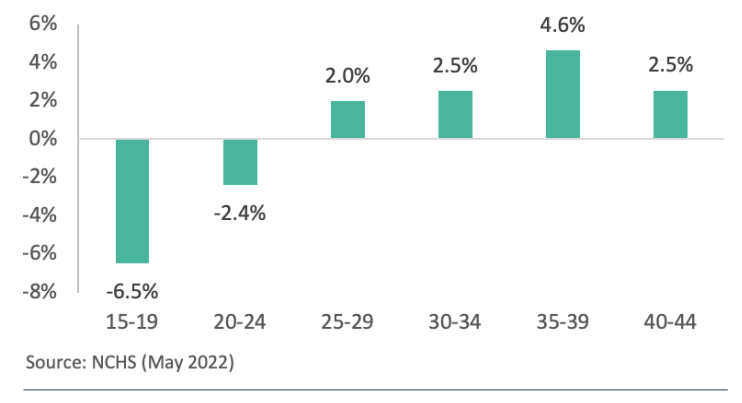
Figure 2 Percentage Change in the U.S. Birthrate, by Age Group, from 2020 to 2021

Changes in birthrates by race and ethnicity also seem broadly consistent with a one-time catch-up. While the birthrate of non-Hispanic White women rose by 3